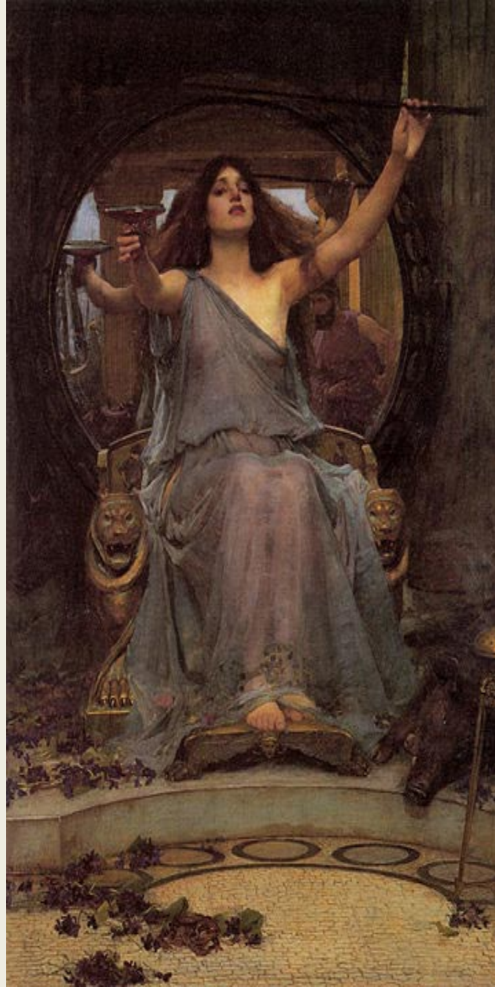
Circe Offering the Cup to Ulysses " by John William Waterhouse

http://www.youtube.com/watch?v=13jAT55z3Eg