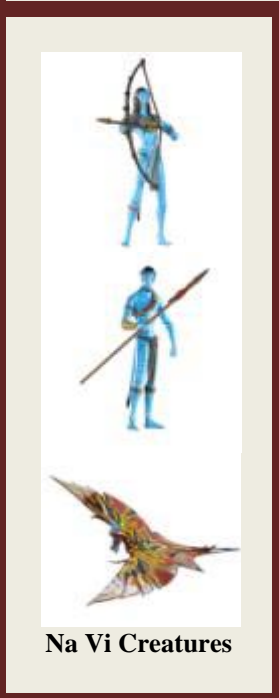
Na Vi Creatures

AVATAR BLUE SPIRIT TOYS ~ Action figures, AVATAR LAST AIRBENDER COMBAT CRASHERS; AVATAR'S LAST WATER FIGURES SPIRITS